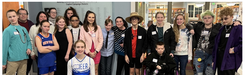
ABOVE: Happy teens after a fun, costumed Murder Mystery Night LEFT: A family enjoying the special solar eclipse at the library.

Library of Things to Borrow: Items to borrow now include board games, snowshoes, & garden seeds, as well as the Birding Backpack, a garden-themed Stay Sharp Memory Kit, & educational activity kits.