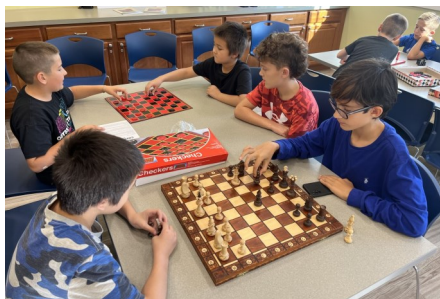
Regular Children's programs:

www.foundation.galwaypubliclibrary.org or contact us at 518-882-8220 or at the.gplf@gmail.com to learn more.