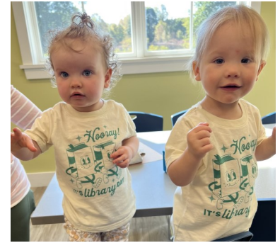
Fostering a Love of Reading!