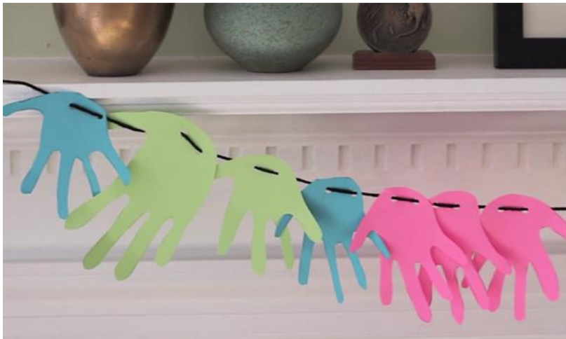
CREATE: Make a Family Hands Garland