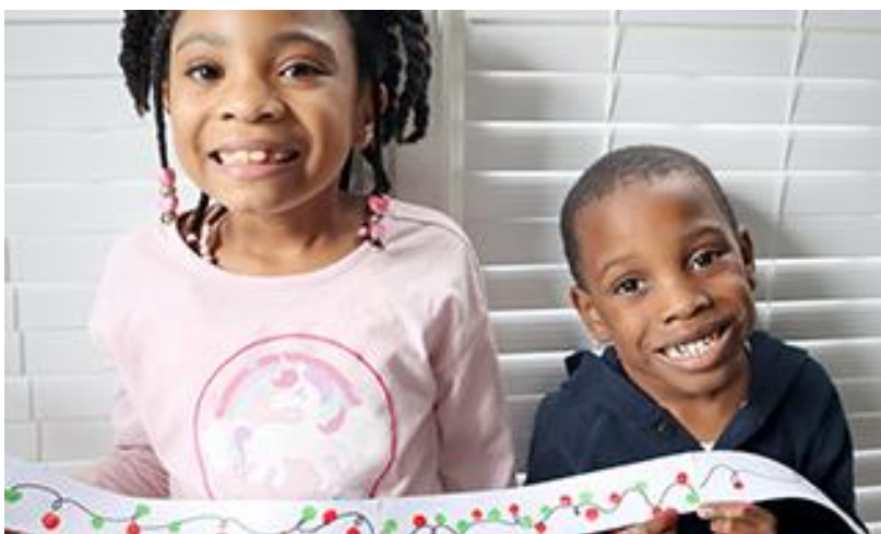
PLAY: 31 Simple Activities to Do Before the New Year