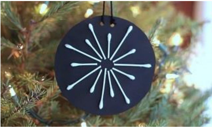
MAKE: DIY Snowflakes With Cotton Swabs