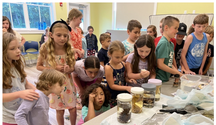
Curiosity about life in the sea during a summer program.

8/5 at 10 - Donuts & Art: A Perfect Pair - This art project merges different art styles. Create while eating donuts!