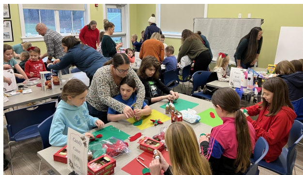
Fun at the popular second annual Holiday Gift Workshop hosted by the Library and the Galway PTSA.