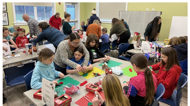
Fun at the popular second Annual Holiday Gift Workshop hosted by the Library and the Galway PTSA.