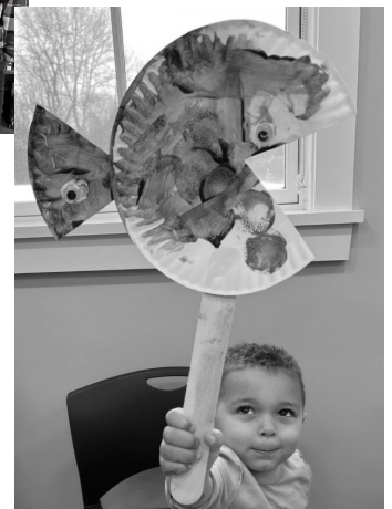
Below: Story Time craft

Having fun isn't hard when you've got a library card!