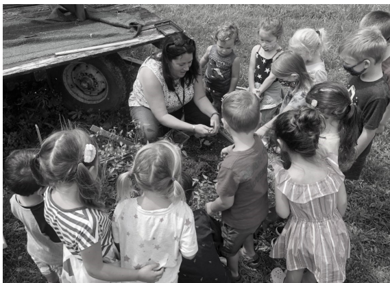
Learning to garden with Miss Julie

8/9 at 1 - Water Bottle Jellyfish - Create a moving jellyfish from recycled materials. (ages 6-12)