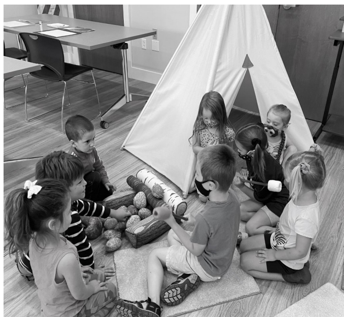
A Camping-Themed Preschool Story Time

See galwaypubliclibrary.org for program additions.