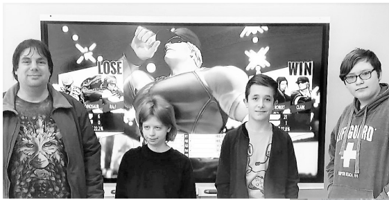
Left: A few esports players