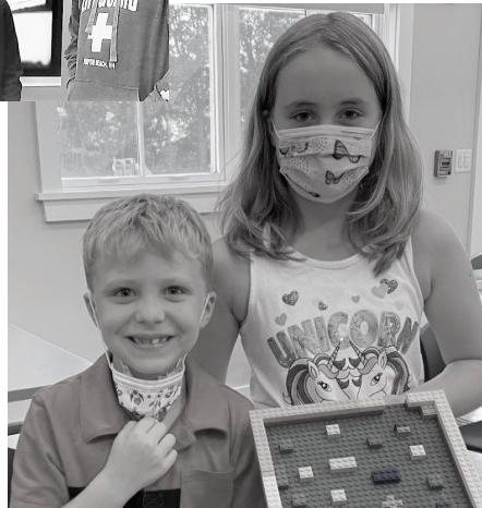
Below: Lego Club STEM fun

Reading is a passport to countless adventures.