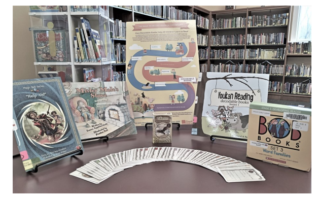
A Sampling of our Early Literary Decodable Materials

parents teach literacy skills to early readers, as well as to assist older students struggling with dyslexia or with reading proficiently. Some of the books include games to make learning more enjoyable, and we also have some guides to assist parents as they strive to help their children excel.