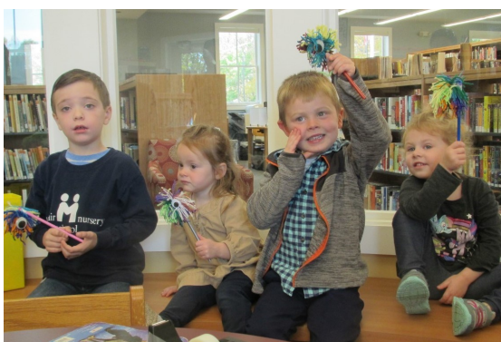
Story Time is FUN!