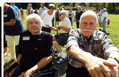
Eager for the festivities to start!

Once we reopen, the library will appreciate your book/DVD donations for addition to our collection or to sell at used book sales to raise funds for the library. We cannot accept textbooks, VHS/cassette tapes, condensed books, encyclopedias, nor legal, medical, or software manuals. Items must be clean and mold-free.