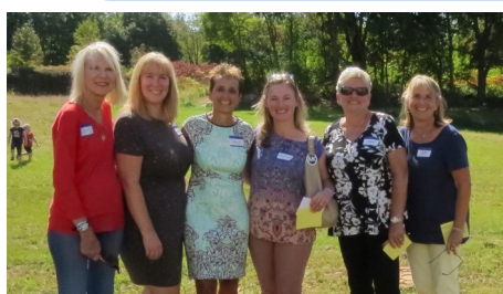
Friends (of the Library)!