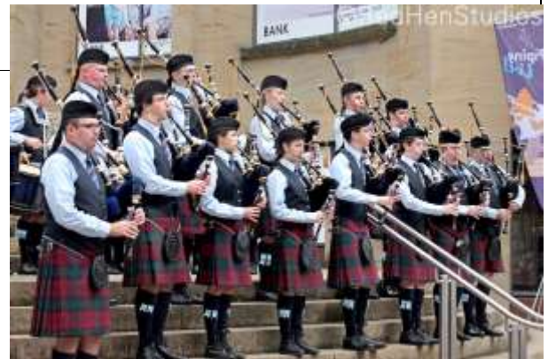
Scotia-Glenville Pipe Band performing in Glasgow, Scotland.

A community service of the Galway Public Library, P.O. Box 207, Galway, NY 12074 Phone: 882-6385. www.galwaypubliclibrary.org .