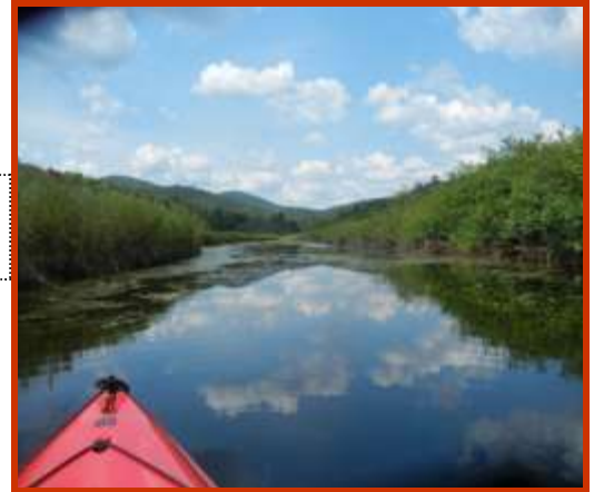
Heading out on a late summer day on one of Saratoga County's waterways.

The Galway Get Together seeks to help build a more cohesive and conservation-minded community through local trade and networking. The Galway Public Library is not responsible for the outcome of any exchange.