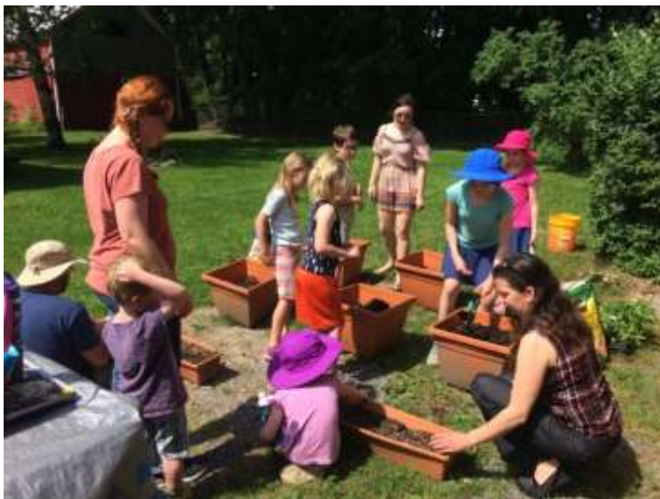
Photo: Planting the "Kids' Garden" at Galway Public Library. Thanks to Sunshine Gardens for donating the plants!

You'll find more information about Route 67 Café and Johnston's Winery in the Galway Get Together website directory . Be sure to follow us on Facebook . Send your information to galwaygettogether@gmail.com