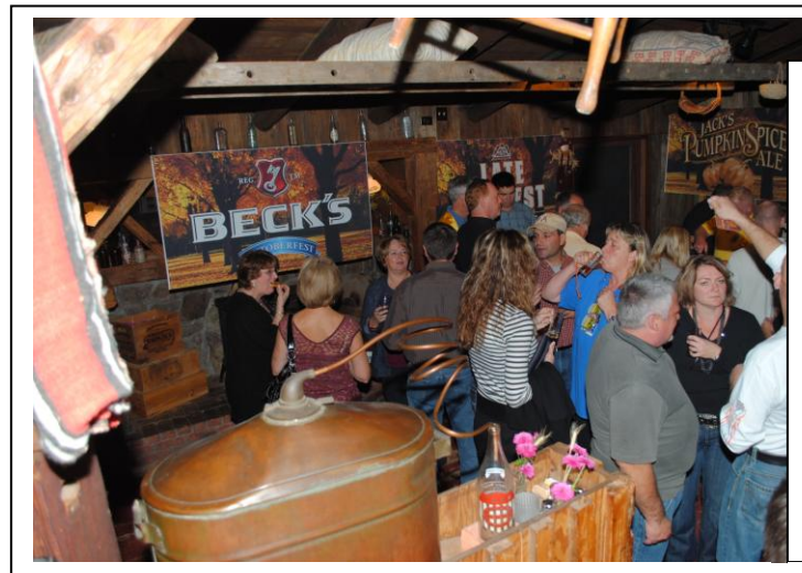
Part of the crowd enjoying the evening!! _