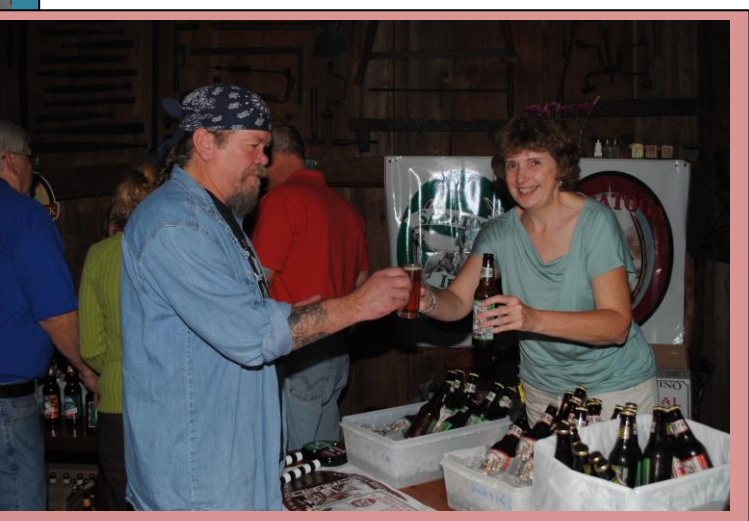
Lion Jill hands out a smile and a drink!!