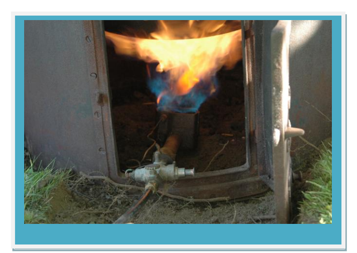
Step #1: Light the cauldron!!

One of our annual fundraisers, when Galway Lions gather at the Village Park, is to prepare our secret chowder recipe and sell the final product to all who visit Galway on Memorial Day. We net a few hundred dollars from this event.