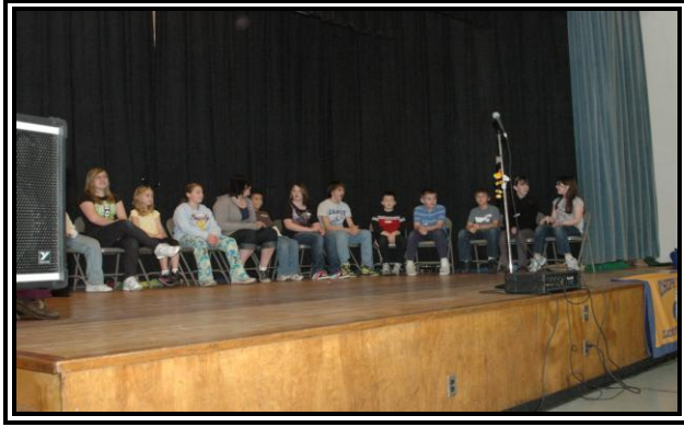
Contestants gather for the big event!!